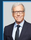
Pierre Bruneau PIERRE BRUNEAU Spokesperson, Director and Founding Member Fondation Charles-Bruneau

Today, we're able to showcase our achievements over the past year thanks in no small part to the continued trust and belief that each and every one of you placed in the Fondation Charles-Bruneau. From the bottom of my heart, thank you.